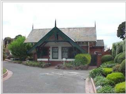
above: The Cheltenham Pioneer Cemetery Office (1999)

Dating the construction of the historic office/residence at the Cheltenham Pioneer Cemetery, let alone the builder and cost has long eluded historians, and indeed the Friends. And while we are no closer to finding the answer, a recent search of the Victorian Government Gazette reveals some possible clues. It goes without saying that without mortality there is no money.