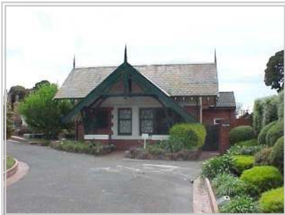
above: The Cheltenham Pioneer Cemetery Office (1999)

Dating the construction of the historic office/residence at the Cheltenham Pioneer Cemetery, let alone the builder and cost has long eluded historians, and indeed the Friends. And while we are no closer to finding the answer, a recent search of the Victorian Government Gazette reveals some possible clues. It goes without saying that without mortality there is no money.