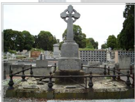
above: Gravesite of the Keys family – CofE "D" 6-8 at the Cheltenham Pioneer Cemetery