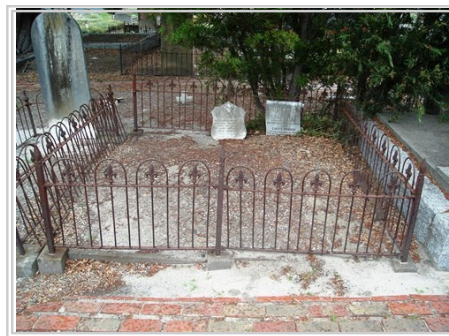
(above) Grave of the Beazley family (Cheltenham Pioneer Cemetery, CofE "E" 151-152)